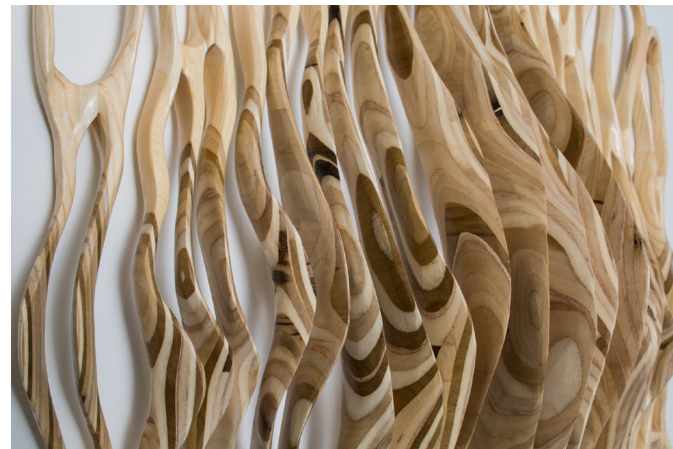
Full Bloom Cascade (detail) , 2015, birch, plywood and pine, 126 x 72 x 12 inches, collection of the artist

This exhibition is generously funded, in part, by the City of Beaumont, the Wesley W. Washburn, M.D. and Lulu L. Smith, M.D. Endowment Fund, the Texas Commission on the Arts, the C. Homer and Edith Fuller Chambers Charitable Foundation and the City of Beaumont-CVB.