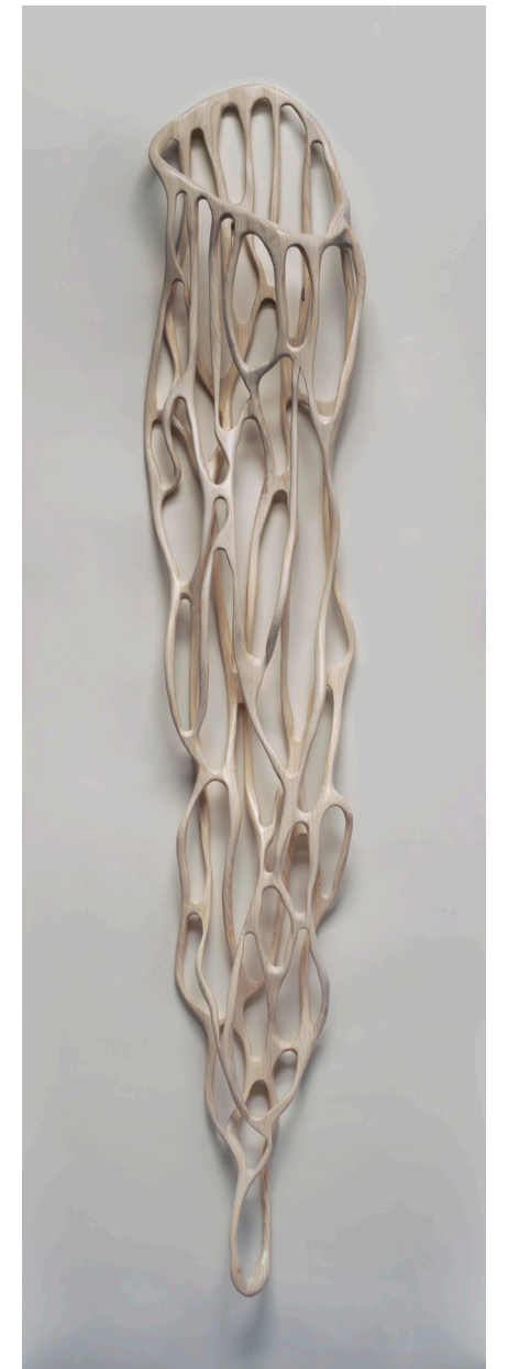
Vessel I, 2014, pine, 84 x 16 x 9 inches, collection of the artist