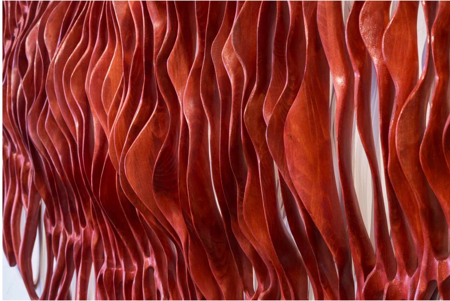
Red Dawn Cascade (detail), 2013, pine, 69 x 60 x 6 inches, collection of the artist